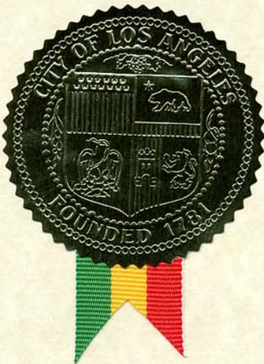
JAMES K. HAHN Mayor

A handwritten signature in black ink that reads "James K. Hahn". The signature is fluid and cursive.